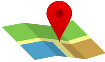
Proof of Address